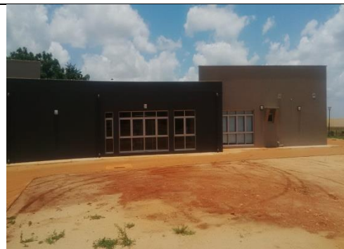
Light fitting installation