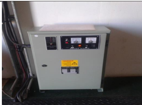
BATTERY UNIT REPLACEMENT