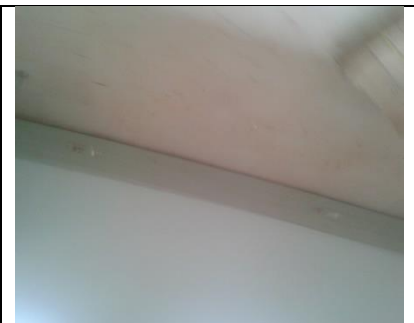
Power skirting installation and wiring

This project also include the installation or connection of a UPS ( Uninterrupted power supply)