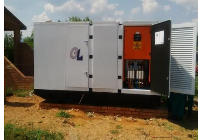
STANDBY GENERATOR INSTALLATION