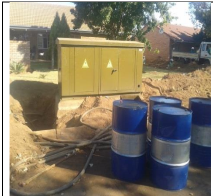
SERVICING OF MINI SUBSTATION