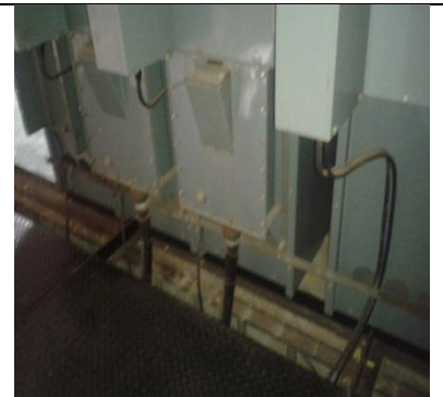
SUBSTATION CABLE REPLACEMENT (HT PILC CABLE)