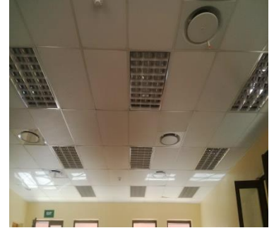
LIGHT FITTINGS INSTALLATION