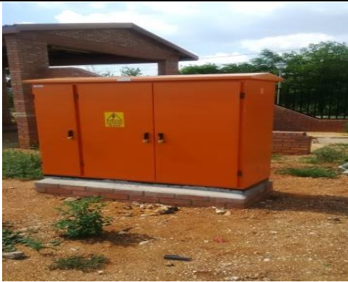
KIOSK INSTALLATION AND CONNECTION