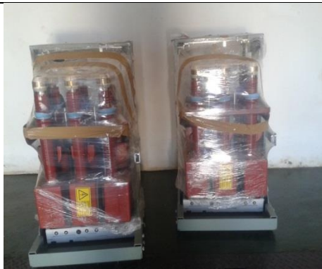
SWITCH GEAR INSTALLATION AND MAINTANANCE