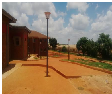
Street lights installation