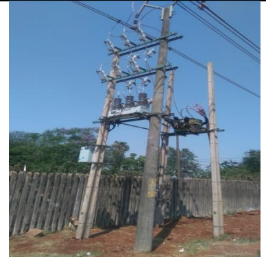
22 KV SUPPLY